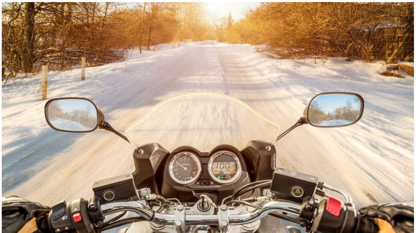
With snow on the ground, the glare from the sun can be a safety hazard, so be sure to wear sunglasses or a tinted motorcycle helmet visor while riding during the winter months.